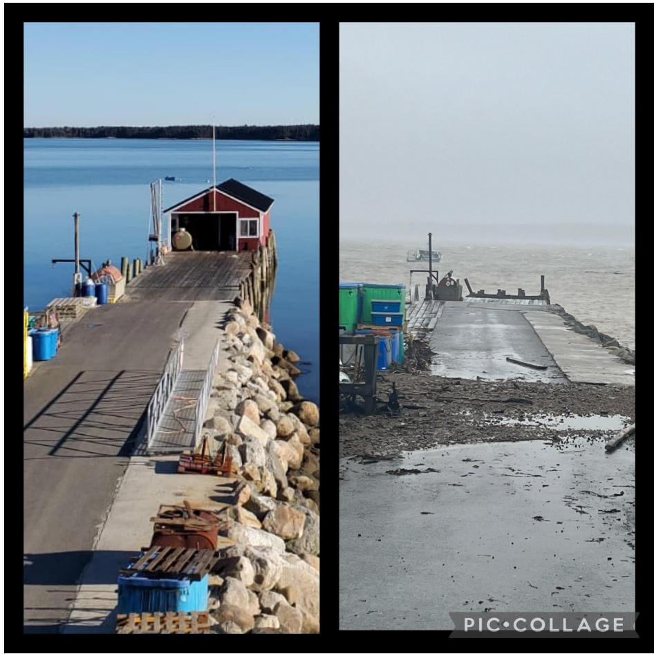
Chipman's Wharf - Milbridge