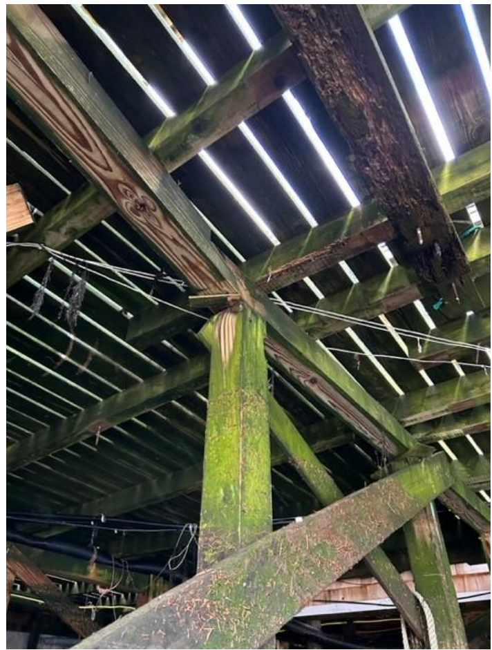
Thurston's Lobster Pound - Bass Harbor