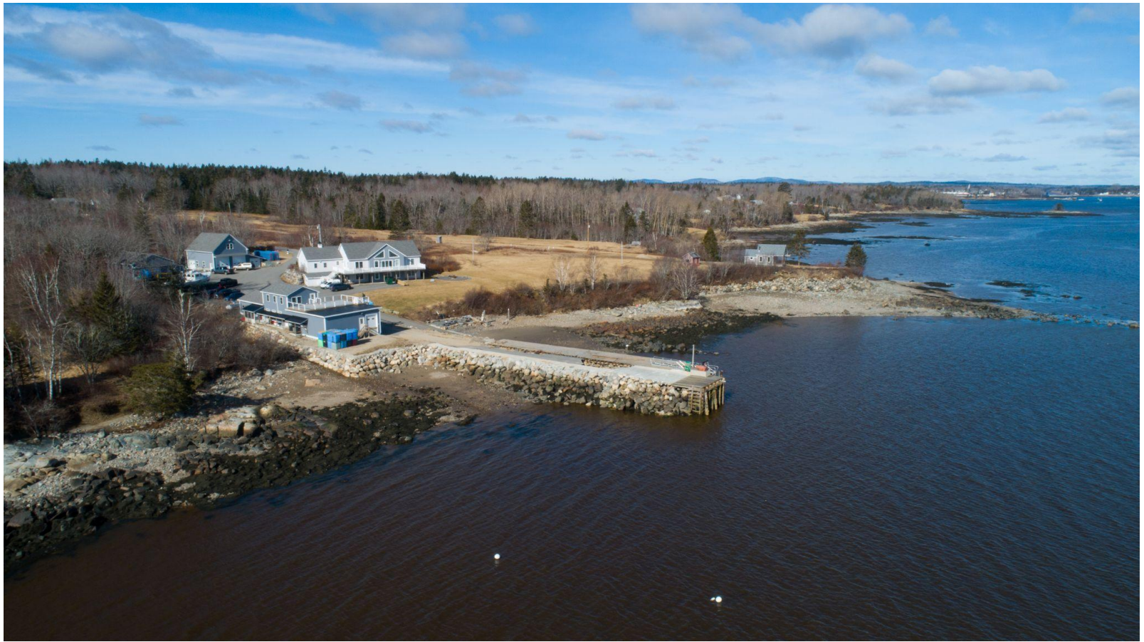
Chipman's Wharf - Milbridge