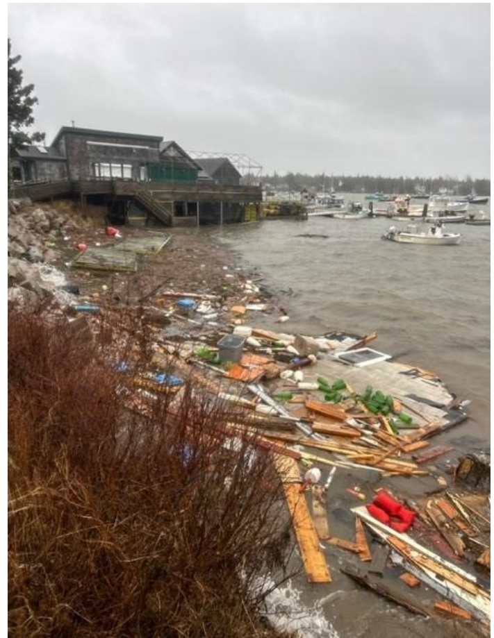
Thurston's Lobster Pound - Bass Harbor