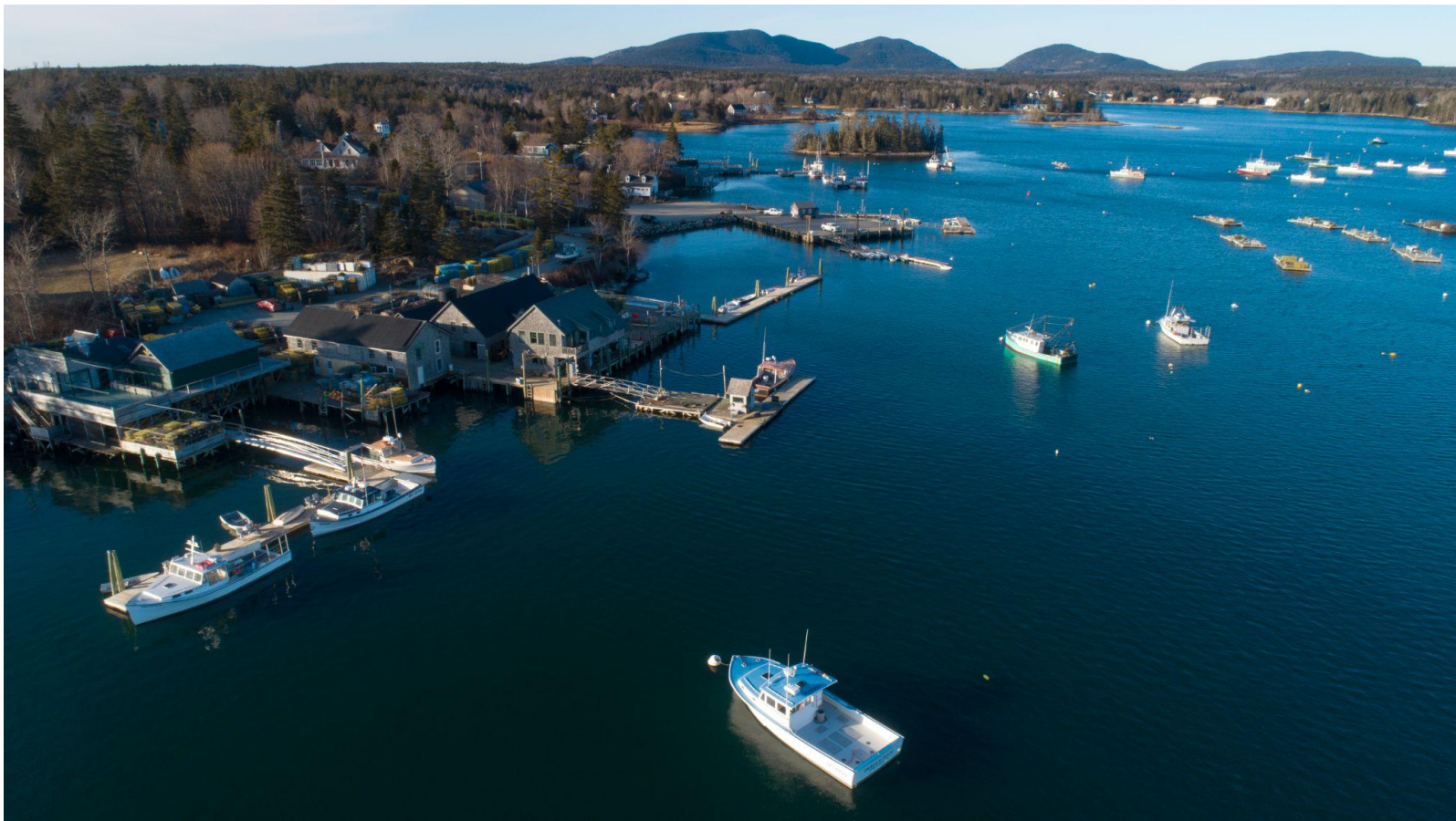
Thurston's Lobster Pound - Bass Harbor