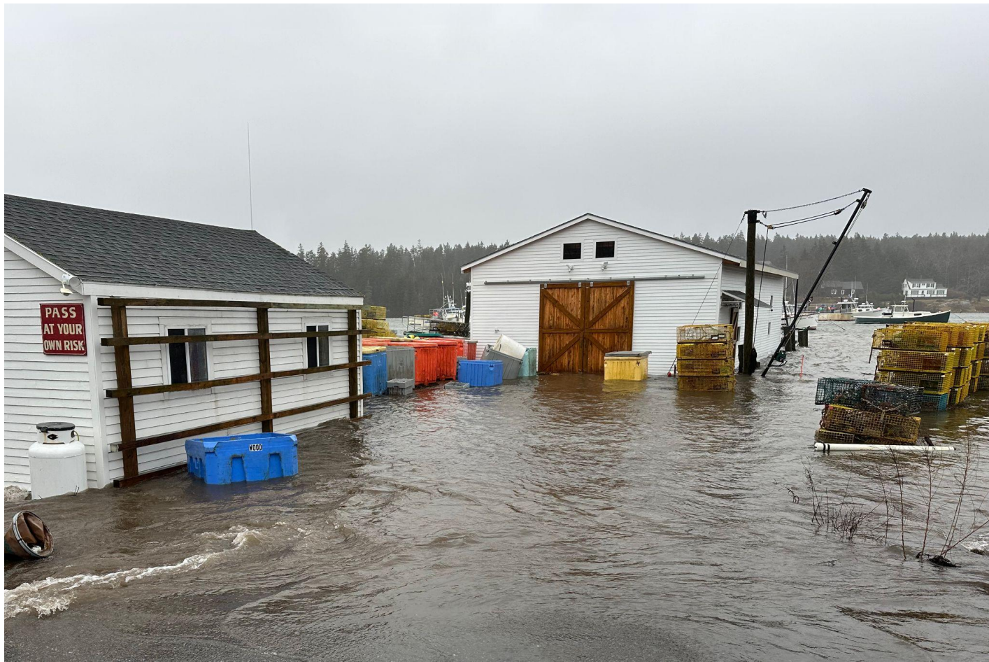
Fifield Lobster Company - Stonington